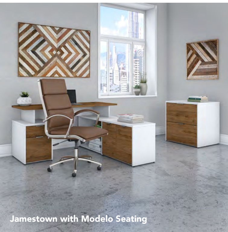
Jamestown with Modelo Seating