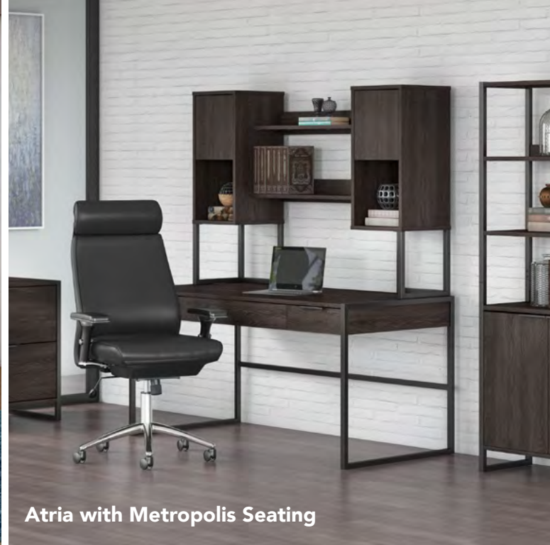
Atria with Metropolis Seating