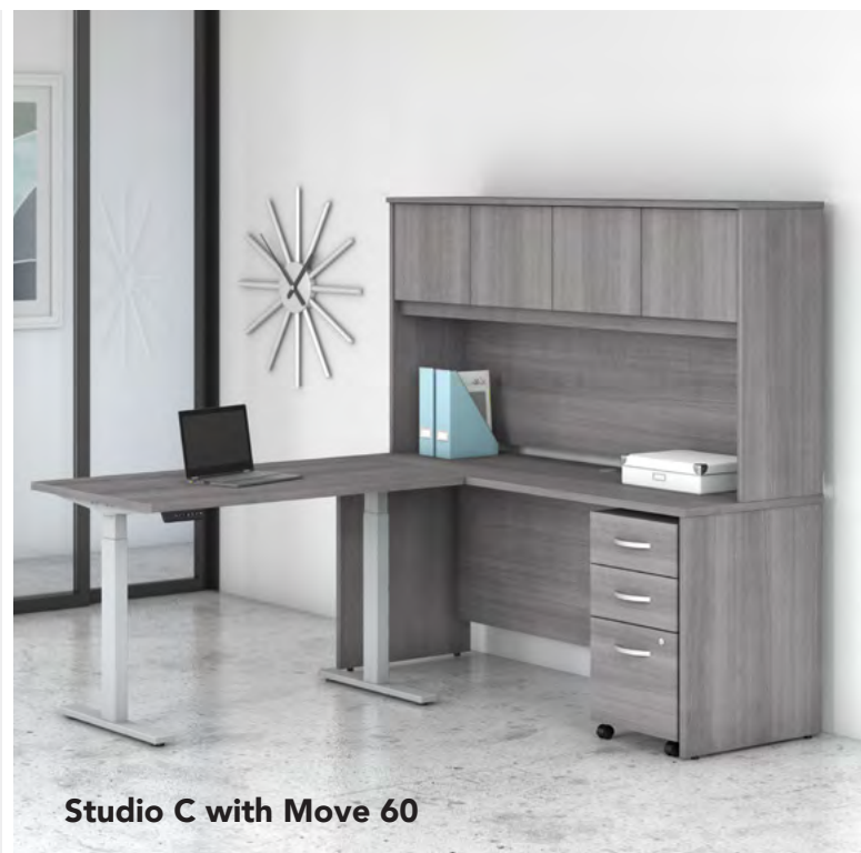
Studio C with Move 60