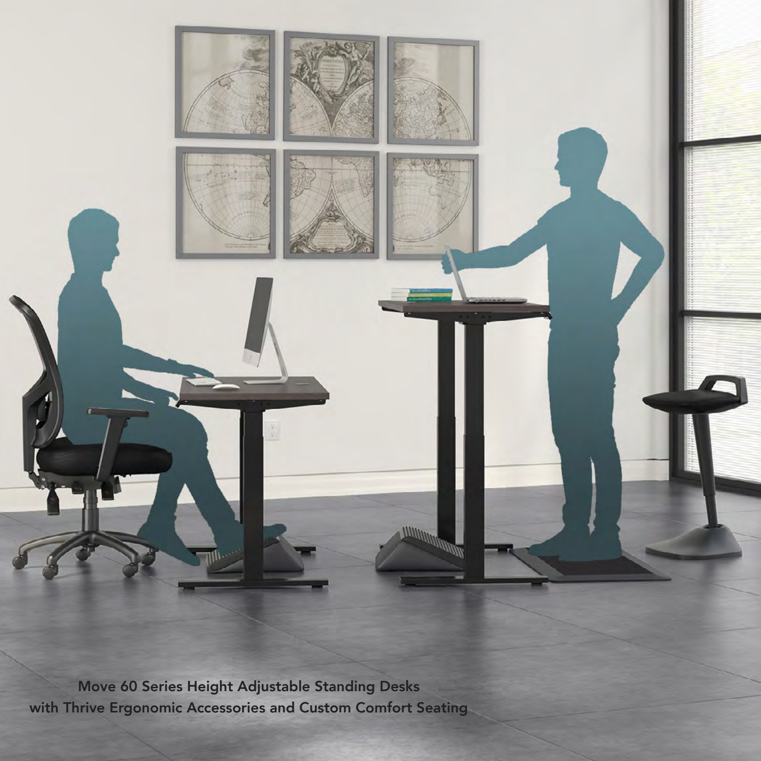
Move 60 Series Height Adjustable Standing Desks with Thrive Ergonomic Accessories and Custom Comfort Seating